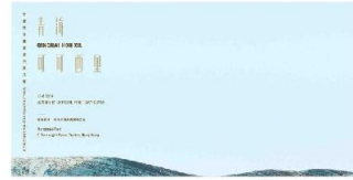
Blank First Day Cover