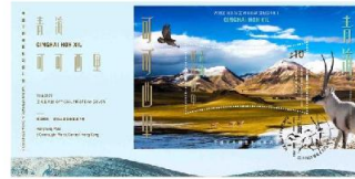
Serviced First Day Cover affixed with a $10 Stamp Sheetlet and date-stamped with associated special postmark.