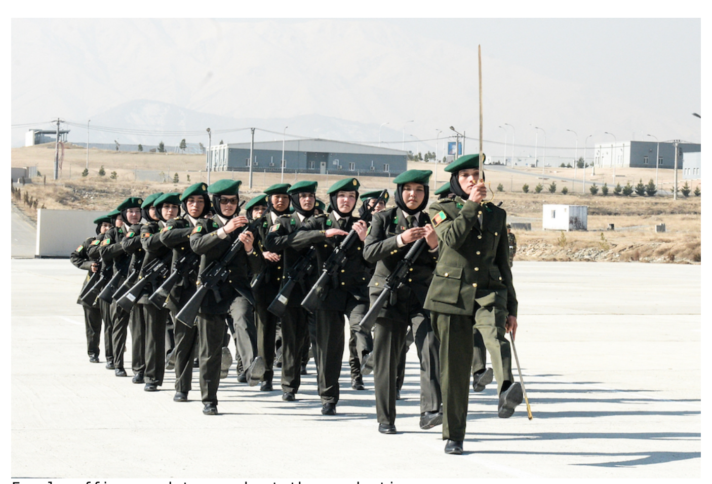
Female officer cadets march at the graduation ceremony.

This year's class has the largest number of female graduates to date, with 23 officer cadets graduating today.