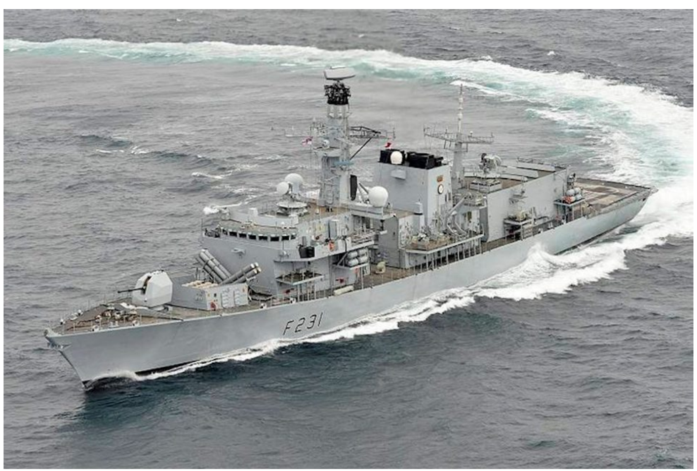
HMS Argyll will deploy to Japan next year, fitted with the Sea Ceptor missile system.

Designed and manufactured by MBDA in the UK, Sea Ceptor is being fitted to replace the Sea Wolf weapon system on the Type 23 frigates and will provide the same capability for the Royal Navy's future Type 26 Frigates.