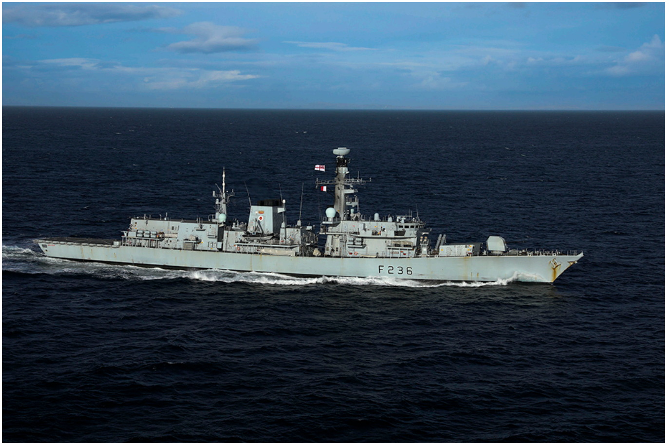
The Type 23 frigate HMS Montrose