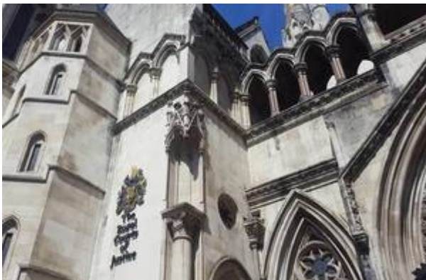
Royal Courts of Justice