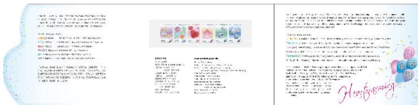
Presentation Pack (Inside).