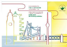
Presentation Pack (Cover).