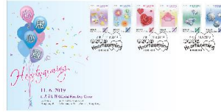
Serviced First Day Cover affixed with a set of 6 Stamps