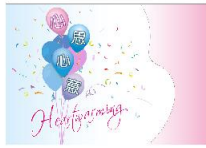
Presentation Pack (Cover).