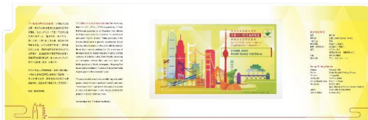
Presentation Pack (Inside).