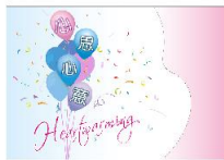
Presentation Pack (Cover).