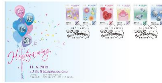
Serviced First Day Cover affixed with a set of 6 Stamps