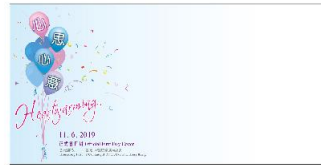
First Day Cover.