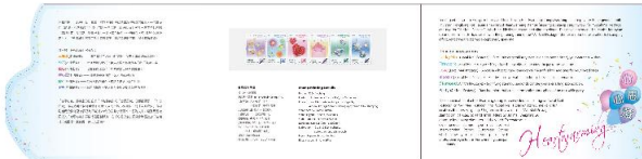
Presentation Pack (Inside).