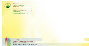
First Day Cover.