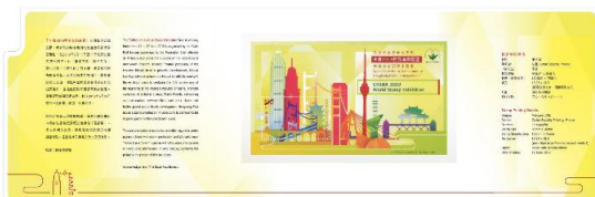
Presentation Pack (Inside).