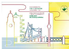
Presentation Pack (Cover).