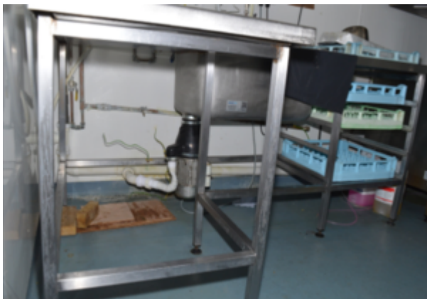
Bishops Wood Hospital kitchen area – sink and macerator underneath

The 36-year-old, who was originally from Stevenage, Hertfordshire, but lived in Letchworth, came into contact with a metal section of the macerator that had been electrified as water had entered the machine's wiring.