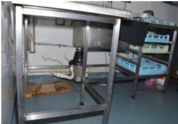
Bishops Wood Hospital kitchen area – sink and macerator underneath

The 36-year-old, who was originally from Stevenage, Hertfordshire, but lived in Letchworth, came into contact with a metal section of the macerator that had been electrified as water had entered the machine's wiring.