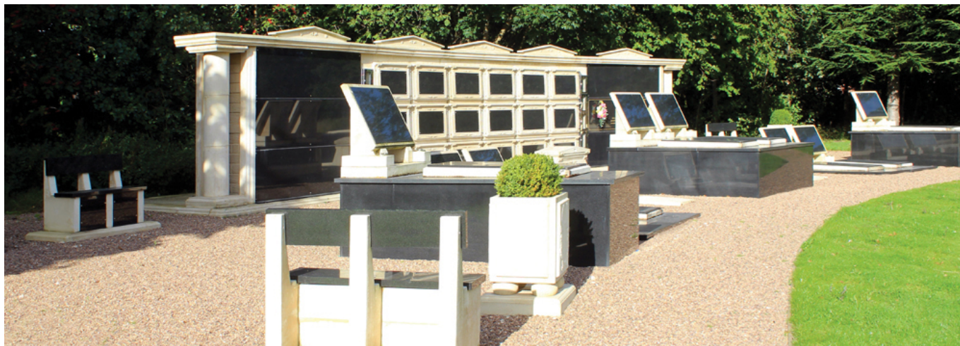
An example of welters' mausolea, sarcophagi and burial chambers

welters organisation introduced the concept of single cast burial chambers, mausolea cells and memorial housings to the industry over 30 years ago and the company continues to design, manufacture, supply and install these facilities nationwide. By operating its own manufacturing facility, the company avoids using third party concrete producers or subcontractors and it also employs dedicated site installation teams to ensure unrivalled service delivery. welters® are presently installing new community mausolea, sarcophagi and burial chambers for a large Midlands based Authority. The installation forms part of a long standing provision of interment facilities carried out over many years, serving both Christian and Muslim communities.