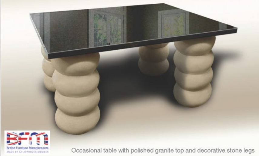
Occasional table with polished granite top and decorative stone legs