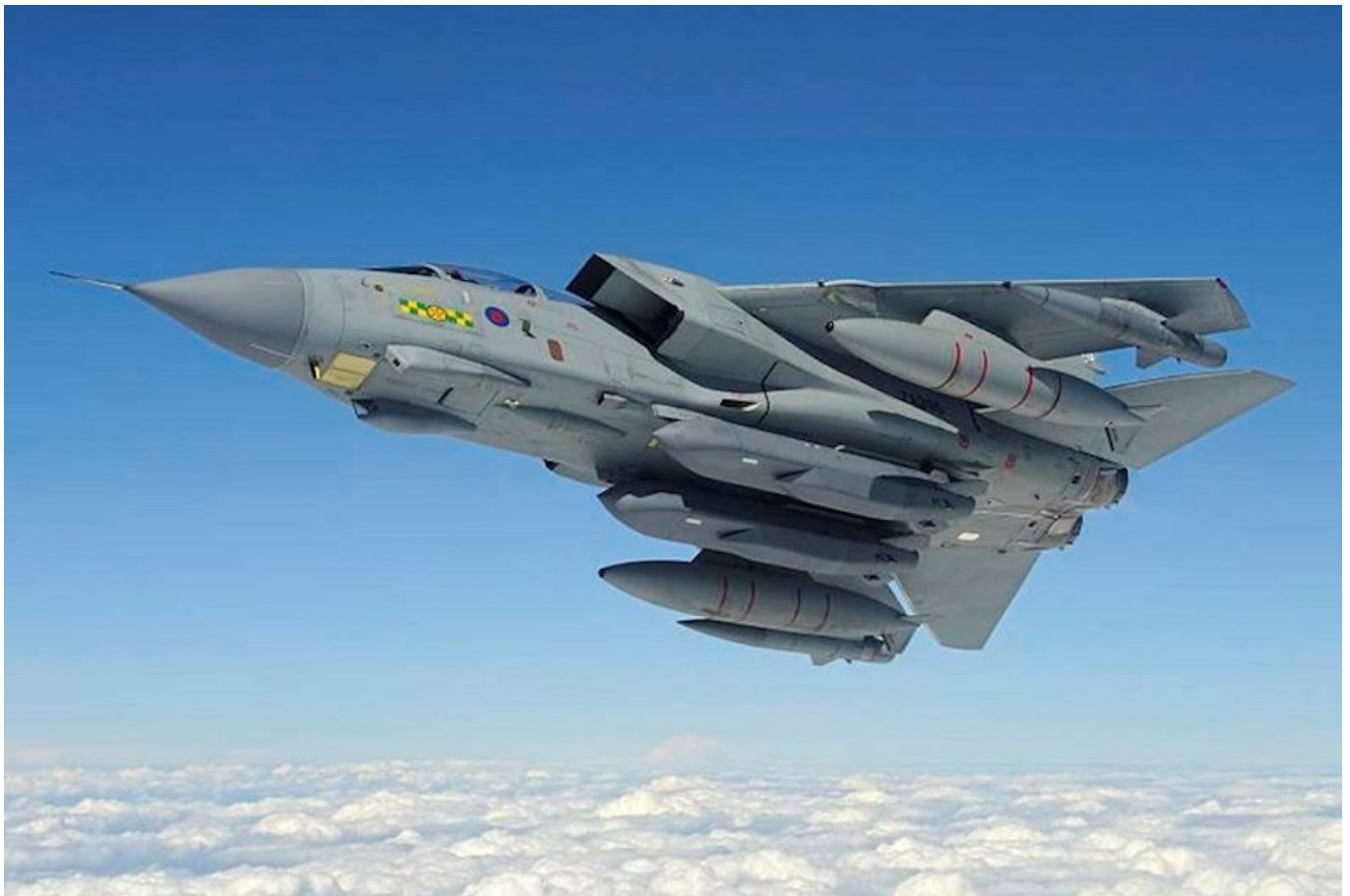
Two Storm Shadow missiles on a Tornado GR4. Crown Copyright.

France; providing our UK Armed Forces with the best equipment possible while sustaining dozens of UK jobs.