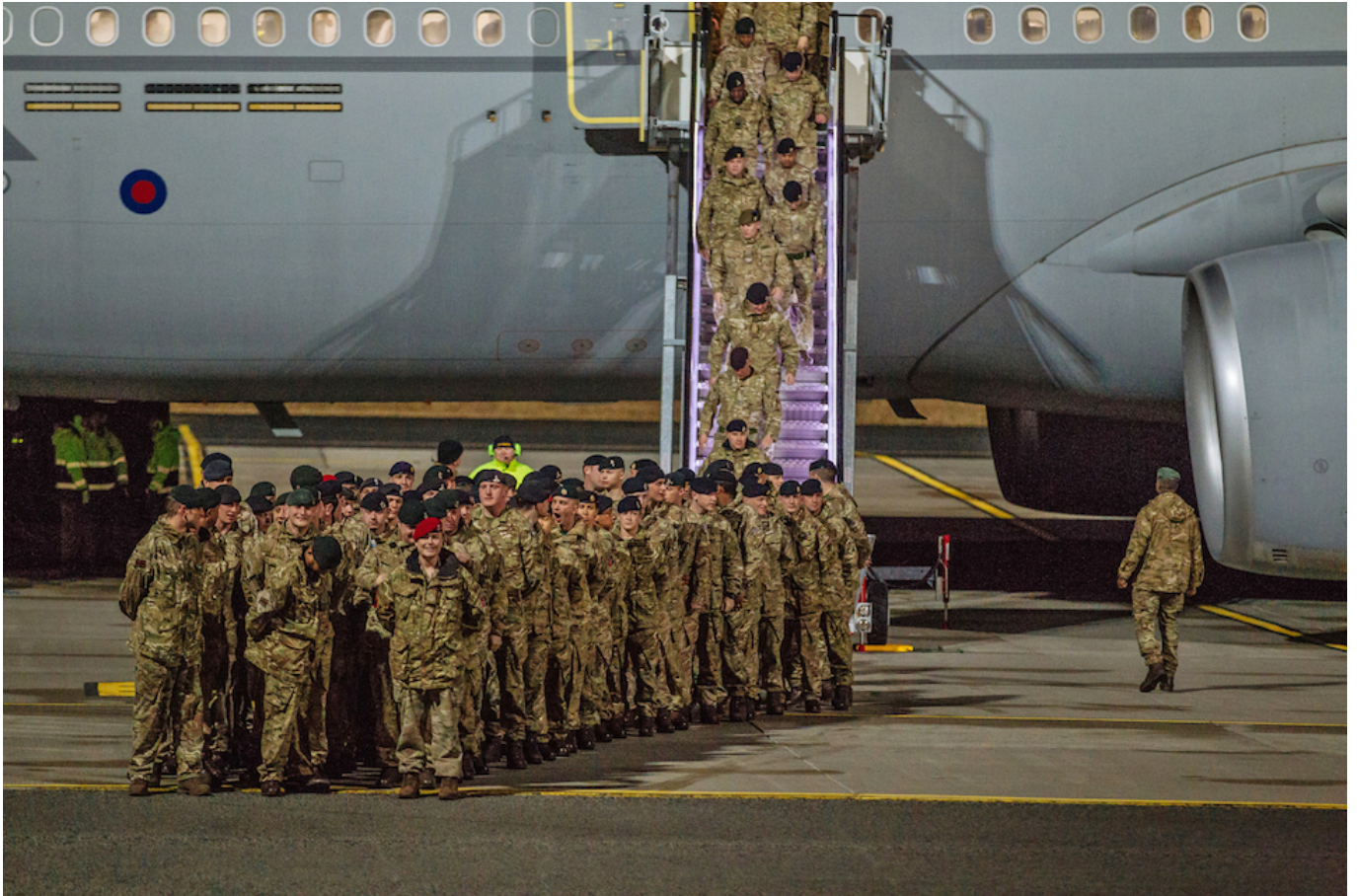
Soldiers from the 5th Battalion The Rifles Battlegroup arrive at Amari airbase, Estonia.

The 120 soldiers are fundamental to setting up a UK headquarters in the country before the rest of the UK deployment arrives next month, increasing the total number of troops in Estonia to around 800.