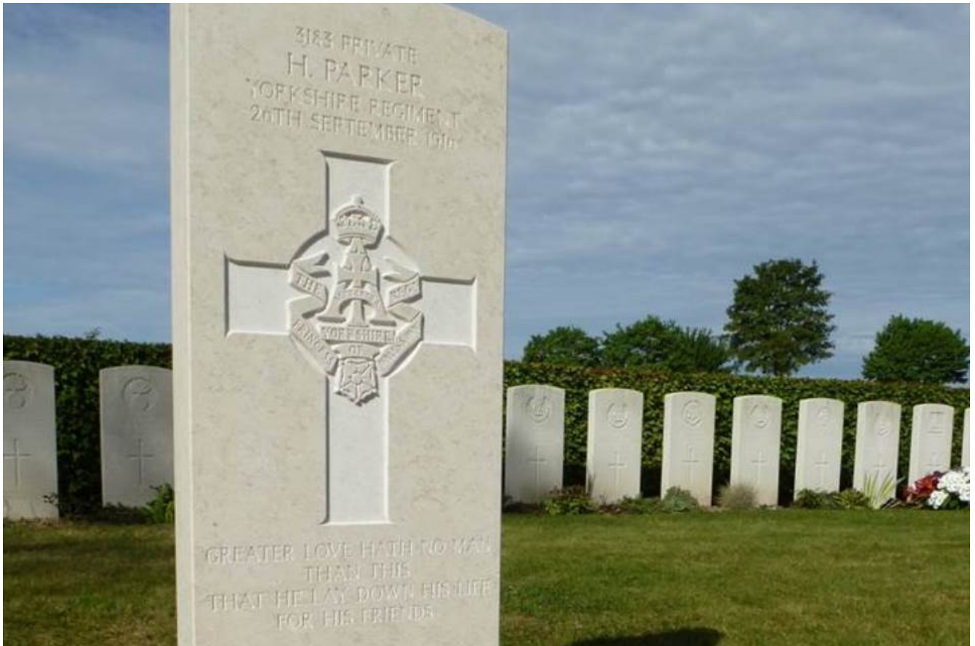
Private Parker's newly engraved headstone