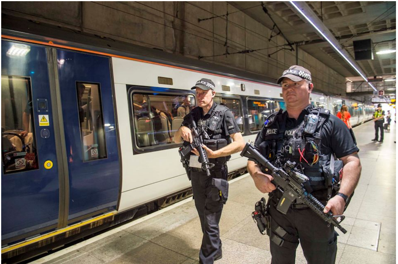
Deployment guarding the Stansted Express