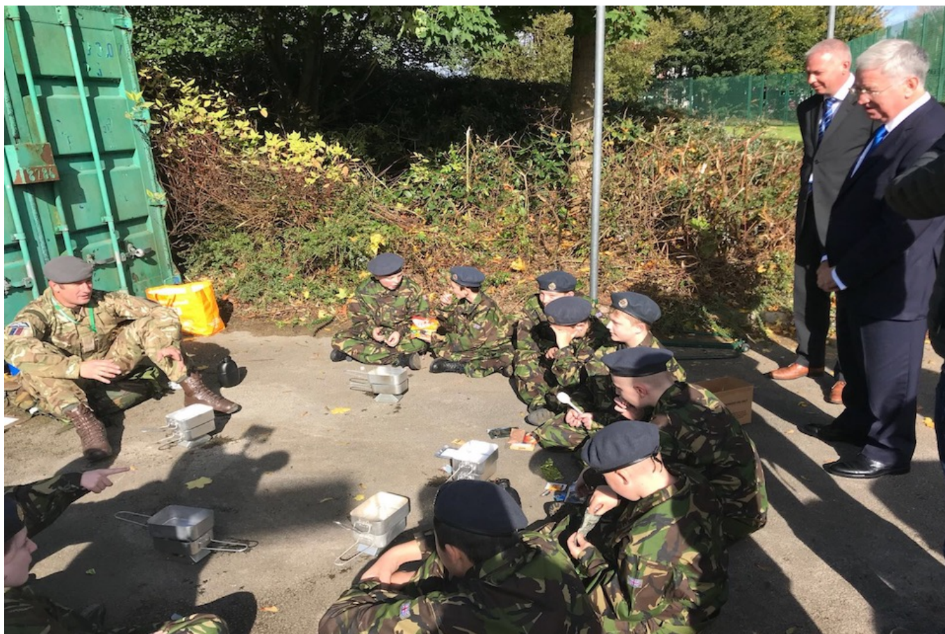
The Defence Secretary observes cadets during a lesson at Albion Academy.