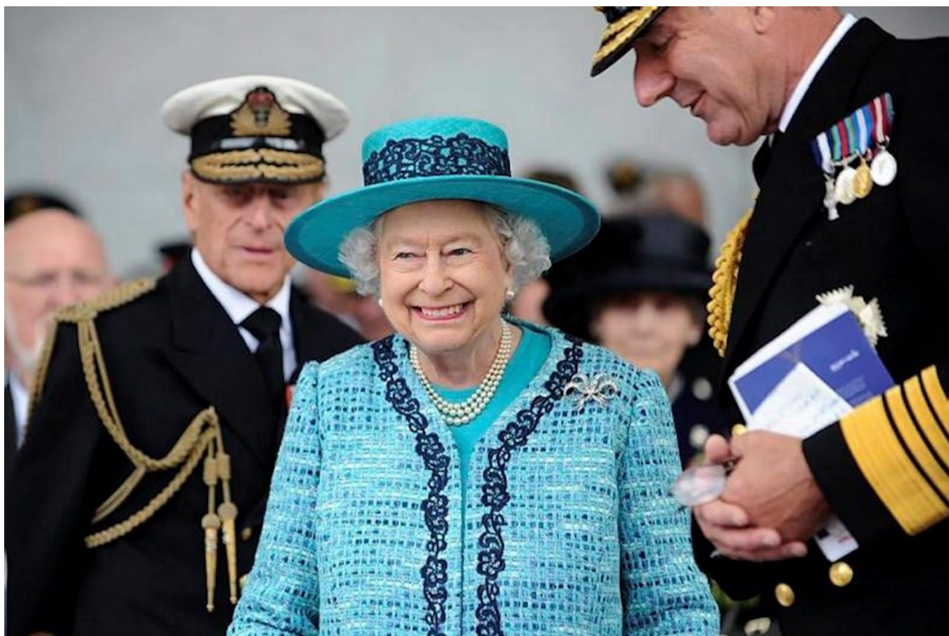
Her Majesty the Queen attending the Naming Ceremony for the new aircraft

In a world of intensifying global threats, this magnificent ship will be a leading force fighting to protect the values of the UK and our allies. It's an honour to visit her at sea, and to meet such a passionate crew. I'm sure Her Majesty will be similarly impressed at next month's historic ceremony for the nation's new flagship, which proudly bears her name.