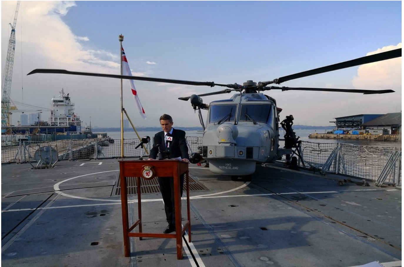
Defence Secretary Gavin Williamson speaking on board HMS Sutherland.