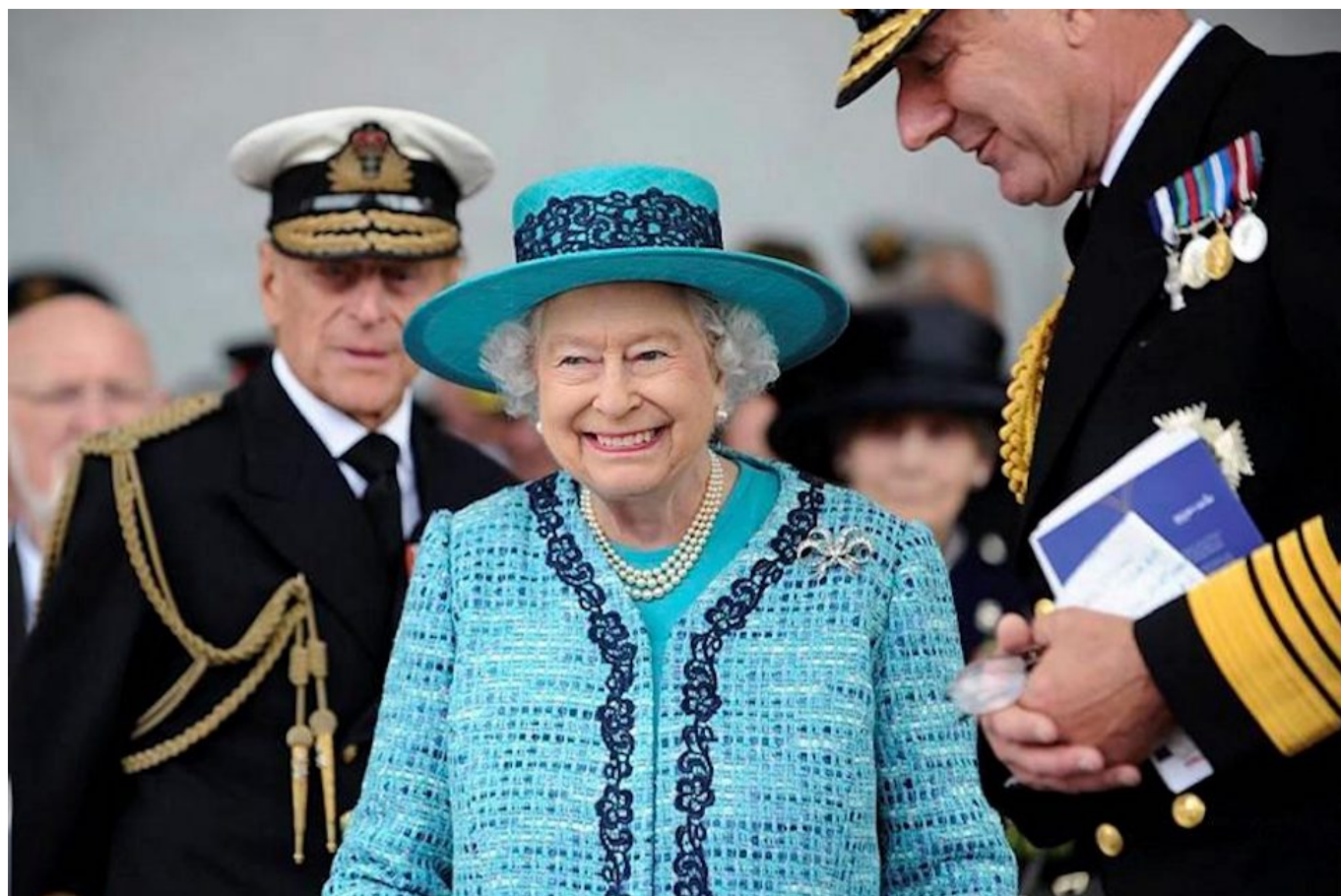
Her Majesty the Queen attending the Naming Ceremony for the new aircraft

In a world of intensifying global threats, this magnificent ship will be a leading force fighting to protect the values of the UK and our allies. It's an honour to visit her at sea, and to meet such a passionate crew. I'm sure Her Majesty will be similarly impressed at next month's historic ceremony for the nation's new flagship, which proudly bears her name.