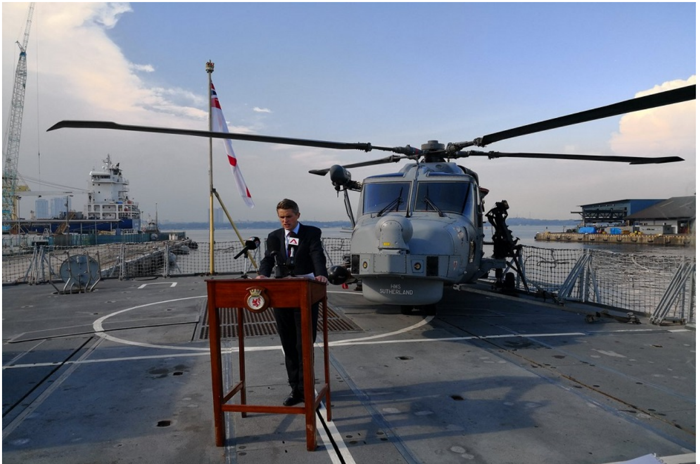
Defence Secretary Gavin Williamson speaking on board HMS Sutherland.