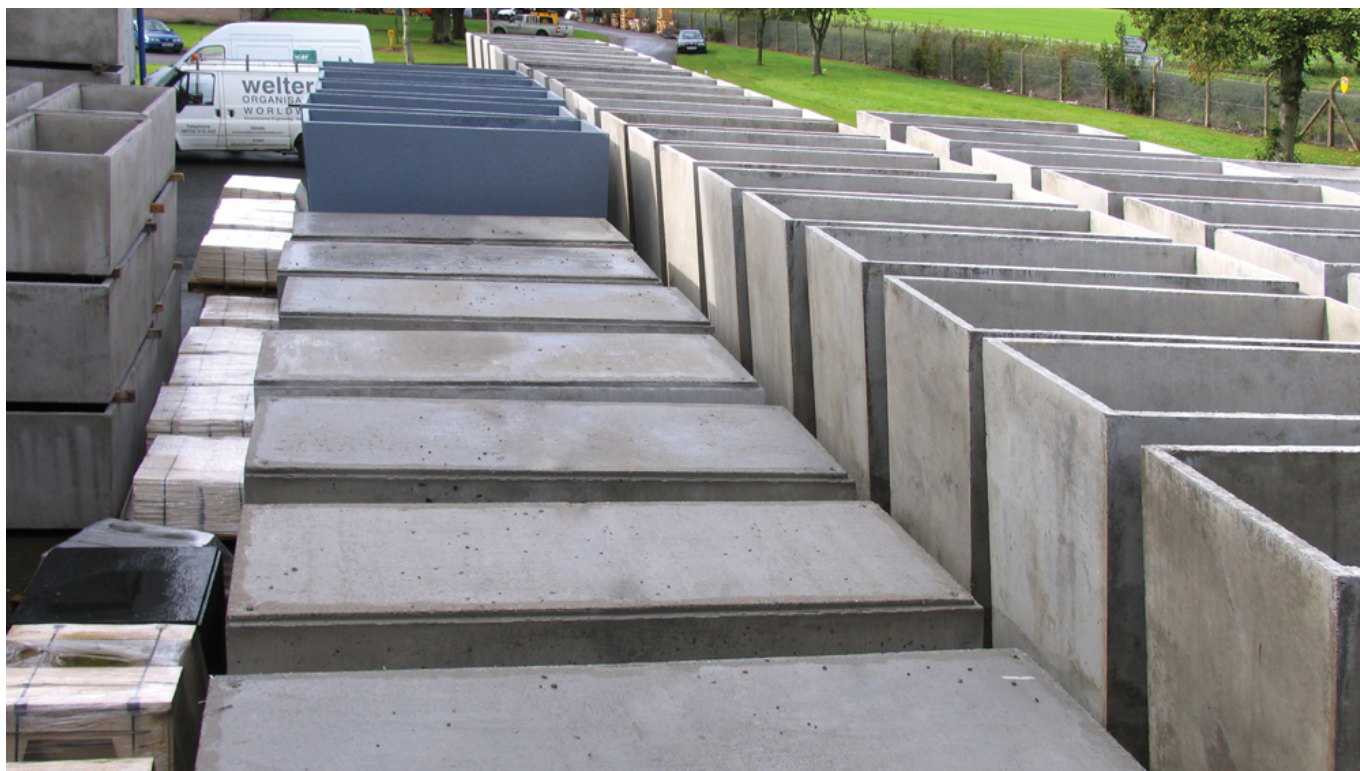
welters manufacturing facility

decorative stone components at its own manufacturing facility, negating the need to use third party concrete producers or installation contractors. This means that the design, production and delivery of all projects is maintained and administered from within the company, giving WOW a strong foundation for a reliable and lasting service provision to its clients.