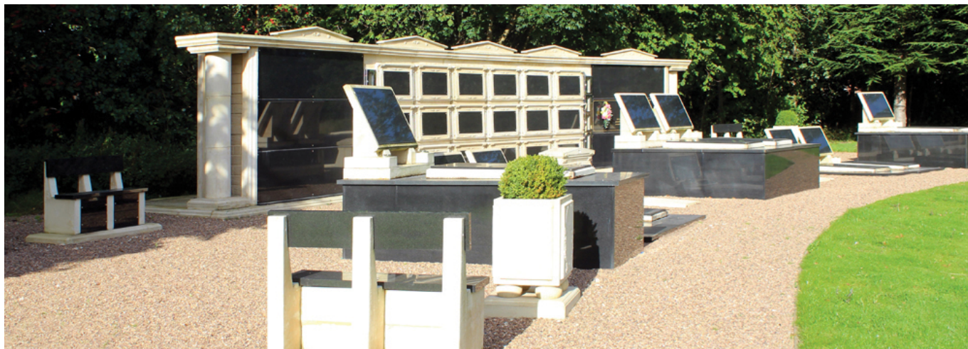
An example of welters' mausolea, sarcophagi and burial chambers

welters organisation introduced the concept of single cast burial chambers, mausolea cells and memorial housings to the industry over 30 years ago and the company continues to design, manufacture, supply and install these facilities nationwide. By operating its own manufacturing facility, the company avoids using third party concrete producers or subcontractors and it also employs dedicated site installation teams to ensure unrivalled service delivery. welters® are presently installing new community mausolea, sarcophagi and burial chambers for a large Midlands based Authority. The installation forms part of a long standing provision of interment facilities carried out over many years, serving both Christian and Muslim communities.