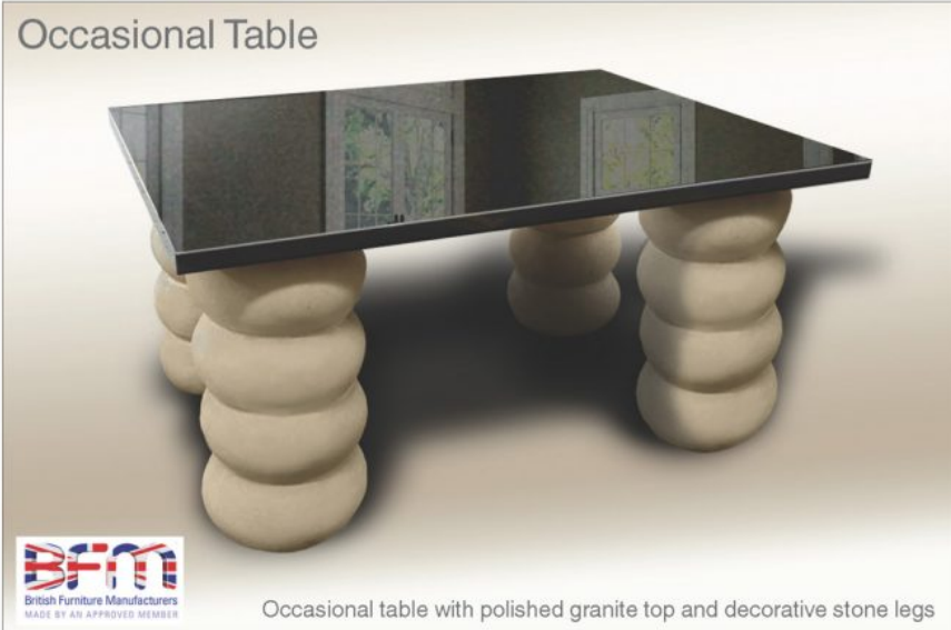
Occasional table with polished granite top and decorative stone legs