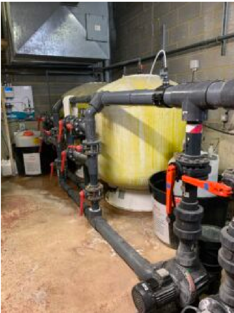
The sodium hypochlorite tank at The Hampshire

He added sodium hydrogen sulphate, also known as sodium bisulphate, to the pool's sodium hypochlorite tank which caused a reaction and resulted in the release of chlorine gas.