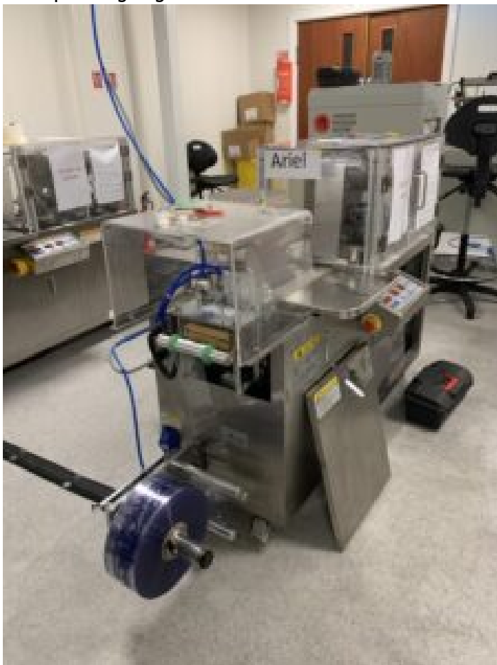
The packaging machine at VN Labs Ltd