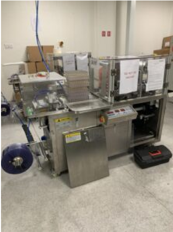
The packaging machine at VN Labs Ltd