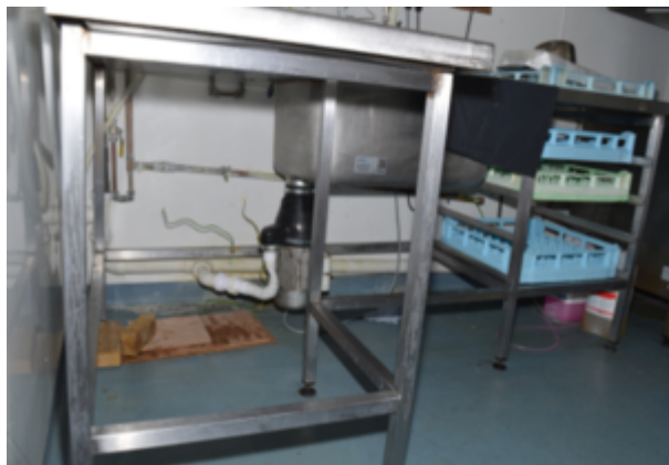
Bishops Wood Hospital kitchen area – sink and macerator underneath

The macerator was not protected by an earth wire and there was no residual current device (RCD) to prevent fatal exposure to the electrical current.