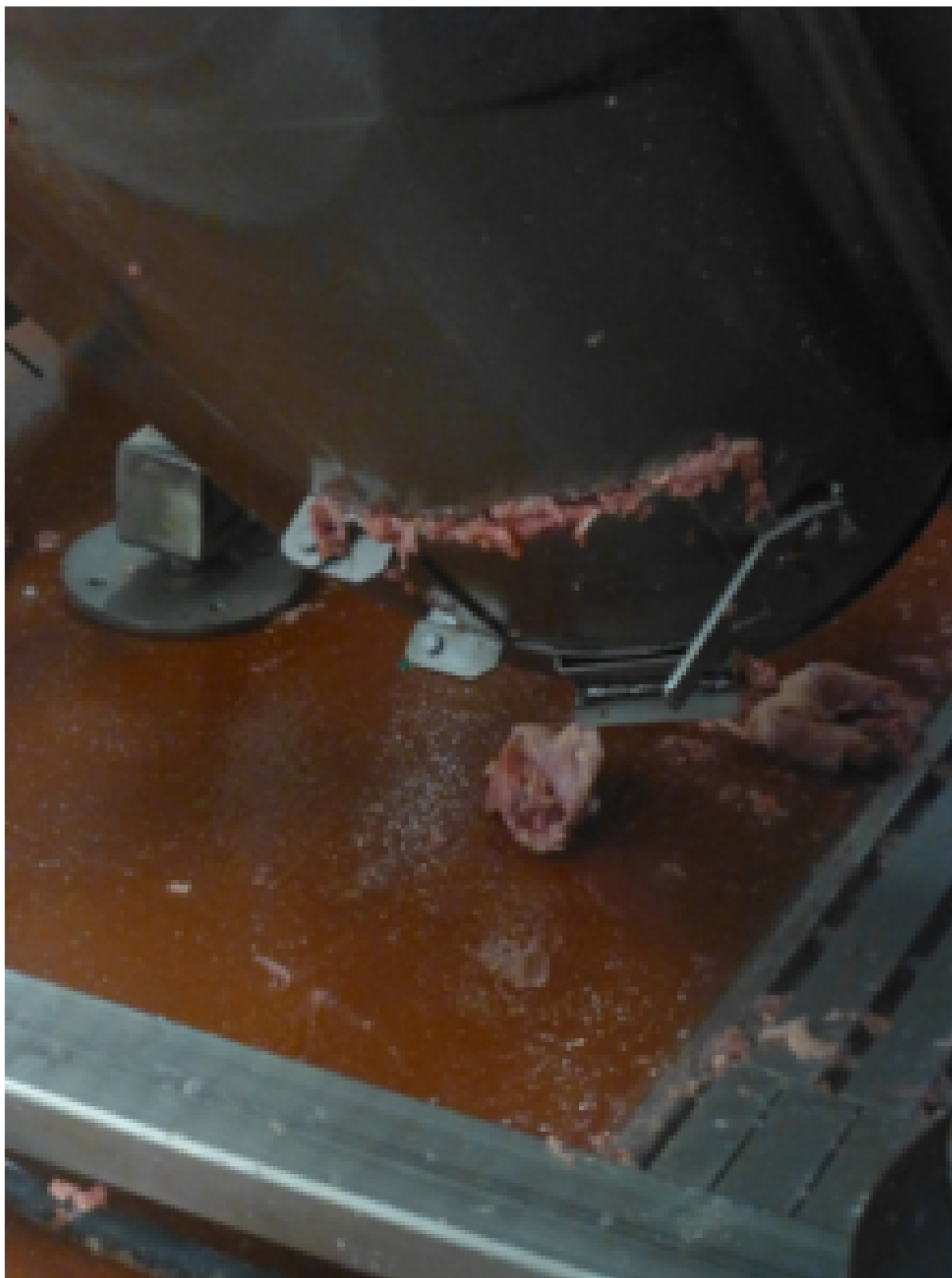
The access panel door at the base of the hopper

While removing the debris however, the auger was still in operation and caught the worker's right arm, drawing it into the machine up to the elbow.