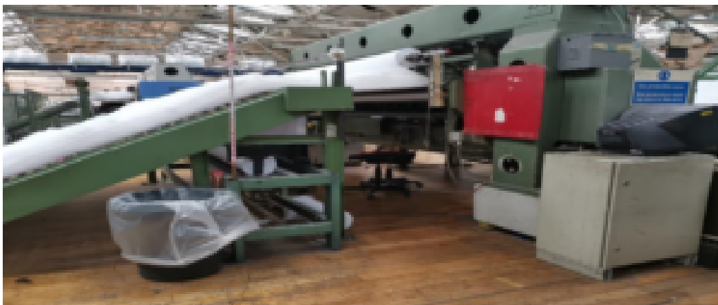
The quilting machine being used by the worker

However, his gloves became tangled in the machine, causing his right hand to be dragged in. This caused lacerations and crush injuries to his right hand and resulted in the tips of two of his fingers to be amputated.