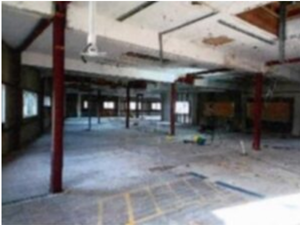
The ground and first floor of the building with AIB present on the walls

All three defendants pleaded guilty to charges relating to a lack of adequate management of the removal of asbestos containing materials.