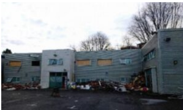
Debris outside the Cavendish centre

An investigation by the Health and Safety Executive (HSE) revealed the company removed an estimated ten tonnes of asbestos insulating board (AIB) during the refurbishment in late 2019 and early 2020. The dangerous materials were stripped out by workers unqualified to do the job and unaware of the risks to their health.