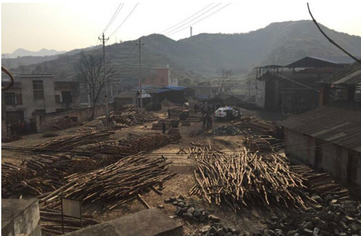
Photo taken on Feb. 14, 2017 shows the scene where a blast hit a coal mine in central China's Hunan province.

Eight people have been confirmed dead and three are missing after a blast hit a coal mine in central China's Hunan province on Tuesday.