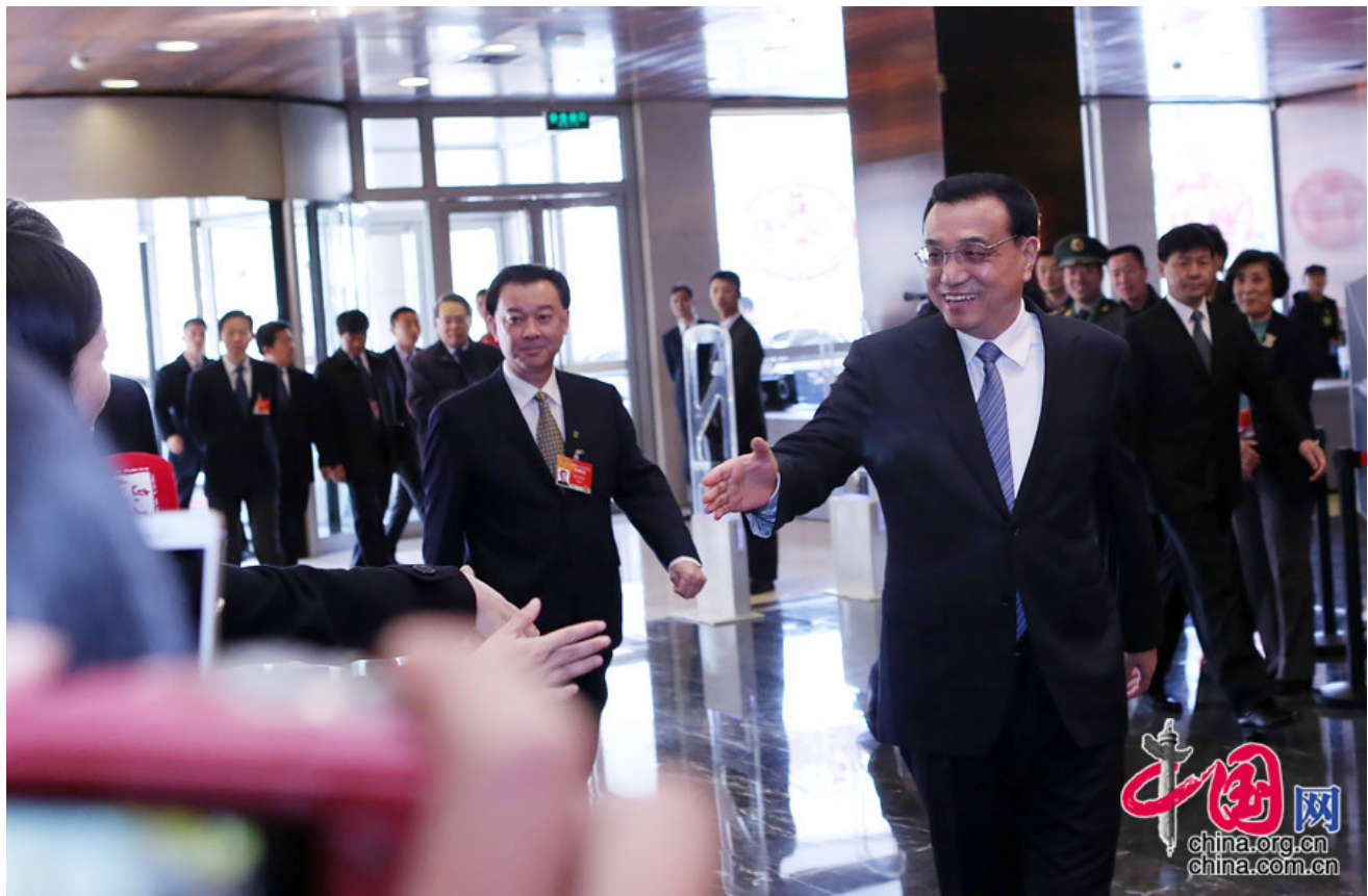
Chinese Premier Li Keqiang goes to join political advisors in their panel discussions on Saturday.

Chinese Premier Li Keqiang and other senior leaders on Saturday joined political advisors in their panel discussions concerning the nation's economic and social development.