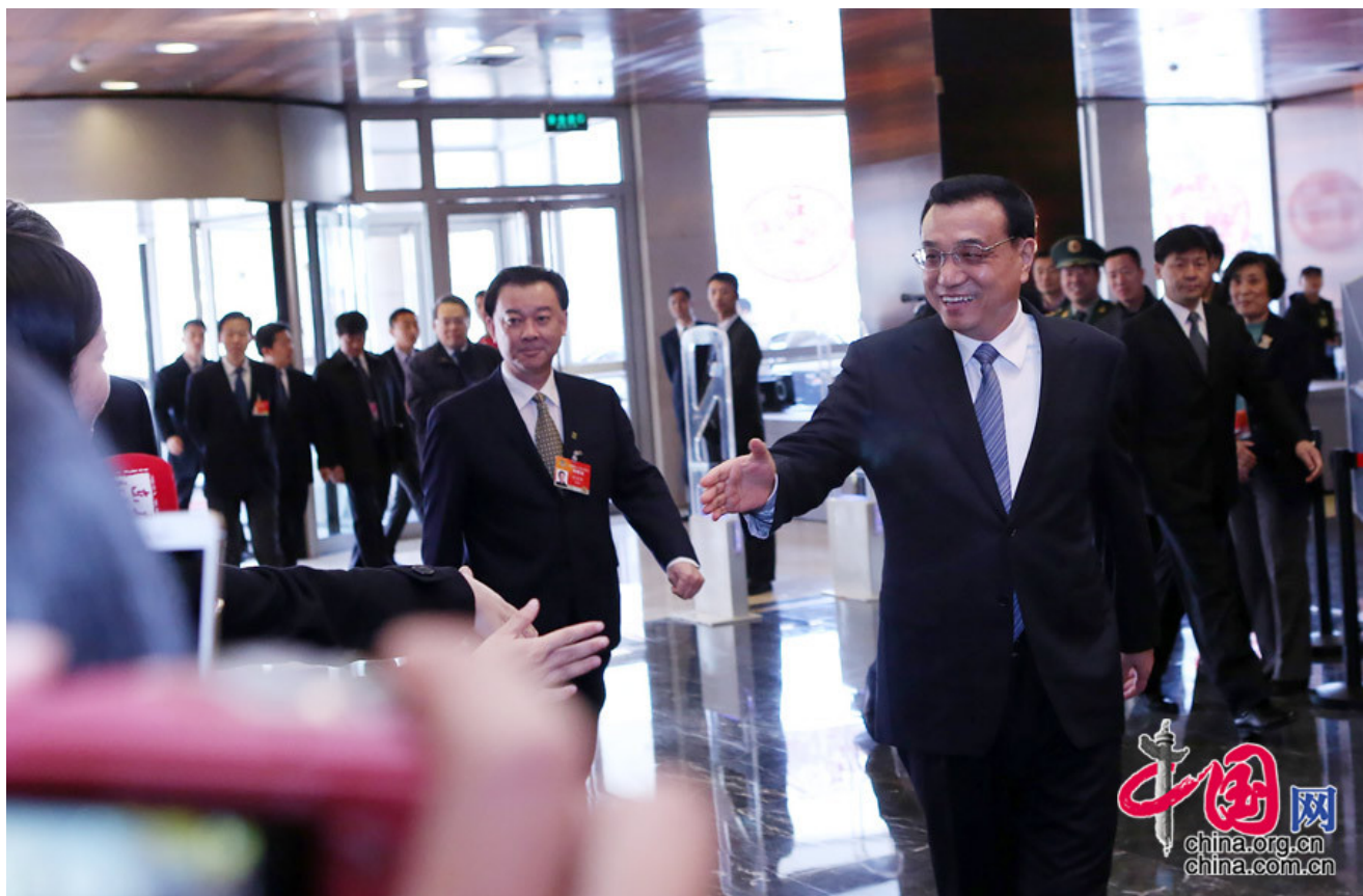
Chinese Premier Li Keqiang goes to join political advisors in their panel discussions on Saturday.

Chinese Premier Li Keqiang and other senior leaders on Saturday joined political advisors in their panel discussions concerning the nation's economic and social development.