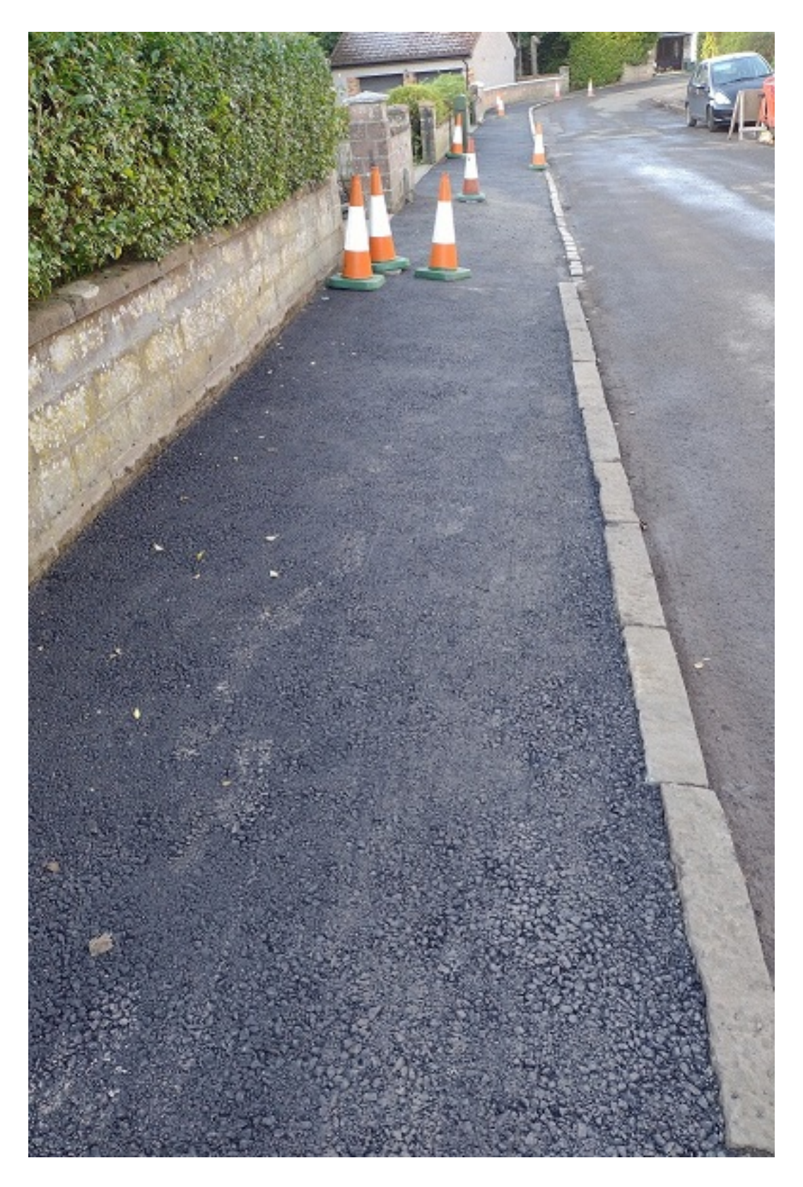
A bit of a tale here ...

Some years ago, in two tranches, the long stretch of unadopted and very poor