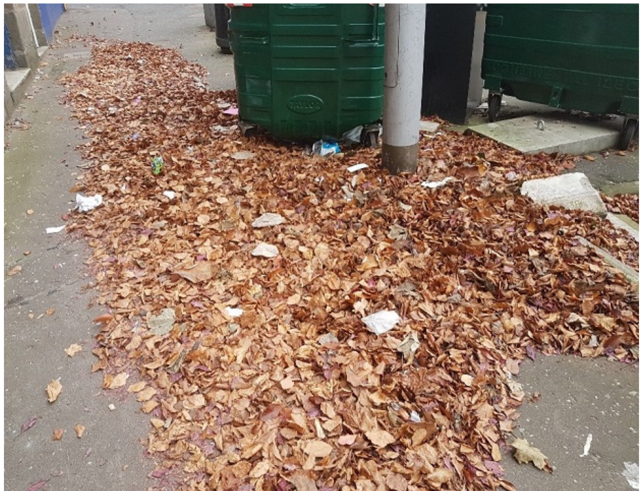
I have asked the City Council's Neighbourhood Services to attend to this.

Residents have contacted me about the extent of fallen leaves on the pavement of Blackness Street — see below :