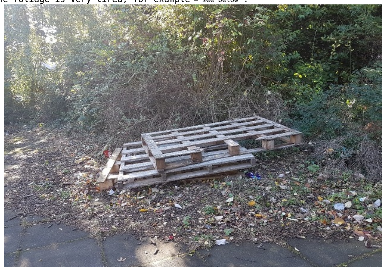
I contacted the City Council about this and the Head of Roads and Transportation has advised:

the foliage is very tired, for example - see below :