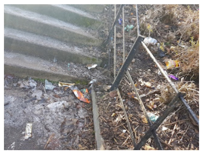
I have taken this up with environment management in the council's Neighbourhood Services and requested a tidy up.