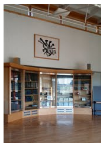
Wighton Heritage Centre, Central Library — Lunchtime Recital Wednesday 7th March at 1.15pm