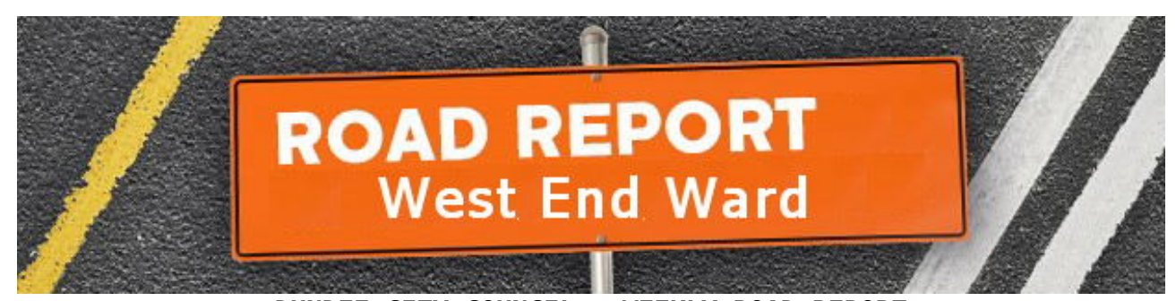
DUNDEE CITY COUNCIL - WEEKLY ROAD REPORT