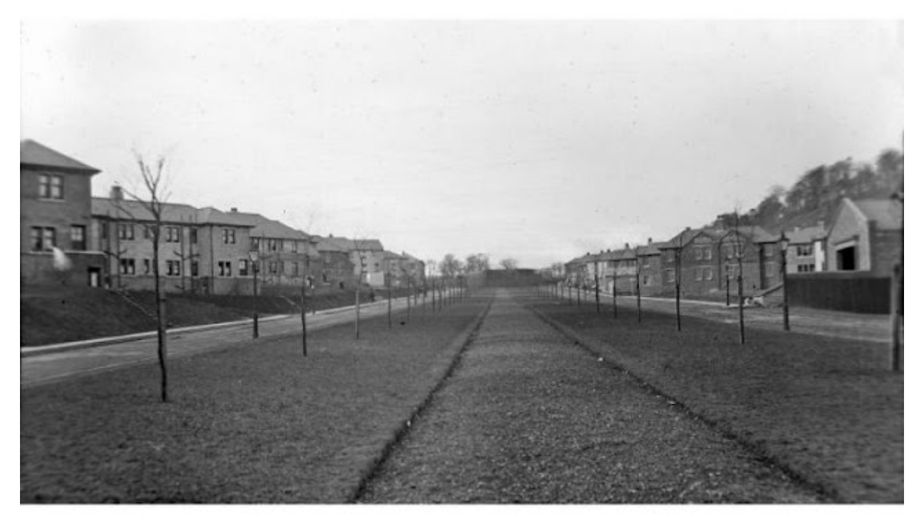
Today marks the centenary of the official opening of the Logie scheme in the West End — happy 100th Logie!

We had planned to have an event tonight in the Lime Street sheltered lounge with local residents to mark this significant milestone and there was to be an exhibition at Blackness Library and in the Central Library along with talks by the Dundee City Archives.