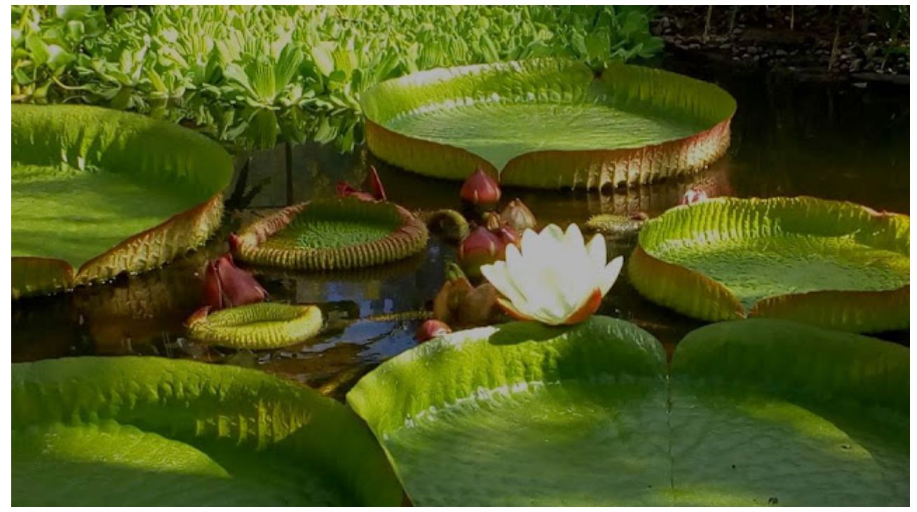
Tomorrow — Thursday 16th July — from the University of Dundee Botanic Garden :

A journey through the steamy foliage of the tropical glasshouse, looking for some of our most beautiful, most ugly and smelliest plants!