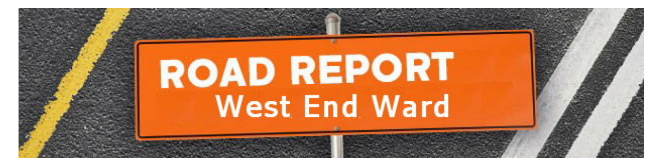
DUNDEE CITY COUNCIL - WEEKLY ROAD REPORT