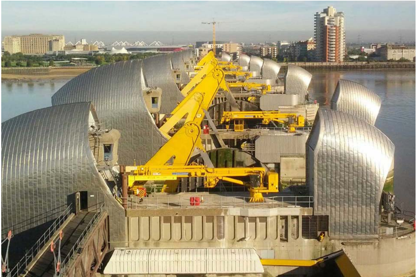
The Thames Barrier