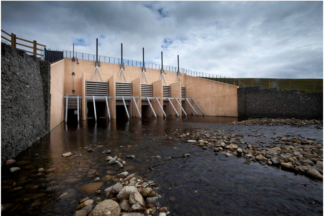
The large dam at Mitford

This has been a great partnership involving local residents, who have played, and continue to play, a vital role in the success of the scheme. It shows that by working together with others we can create long term solutions to reduce the risk of flooding in our communities.