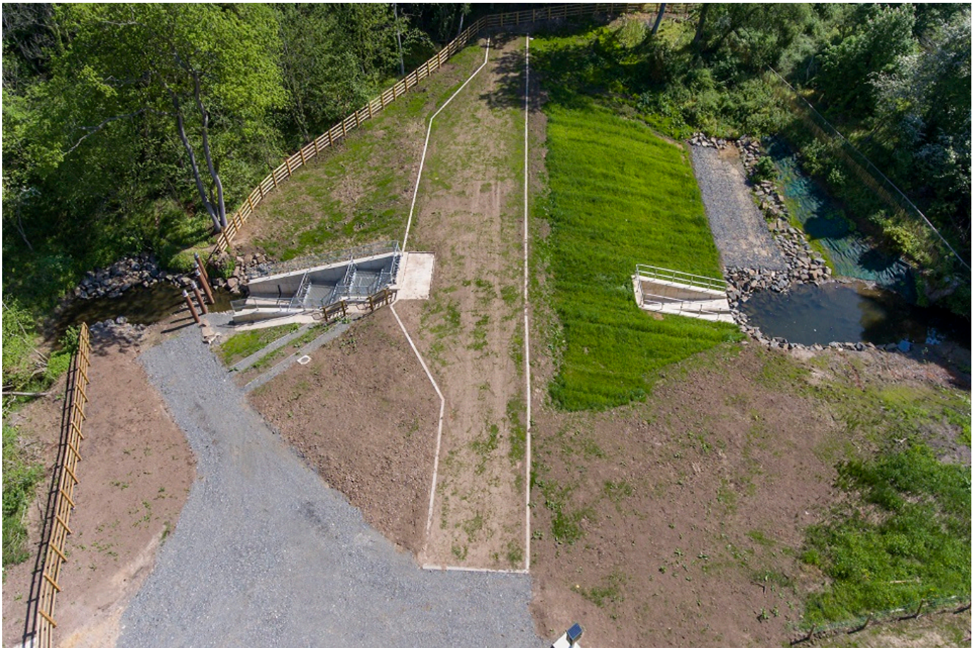
Coting Burn dam aerial image

The dam works alongside other flood protection measures to reduce flood risk to around 1,000 properties in Morpeth.