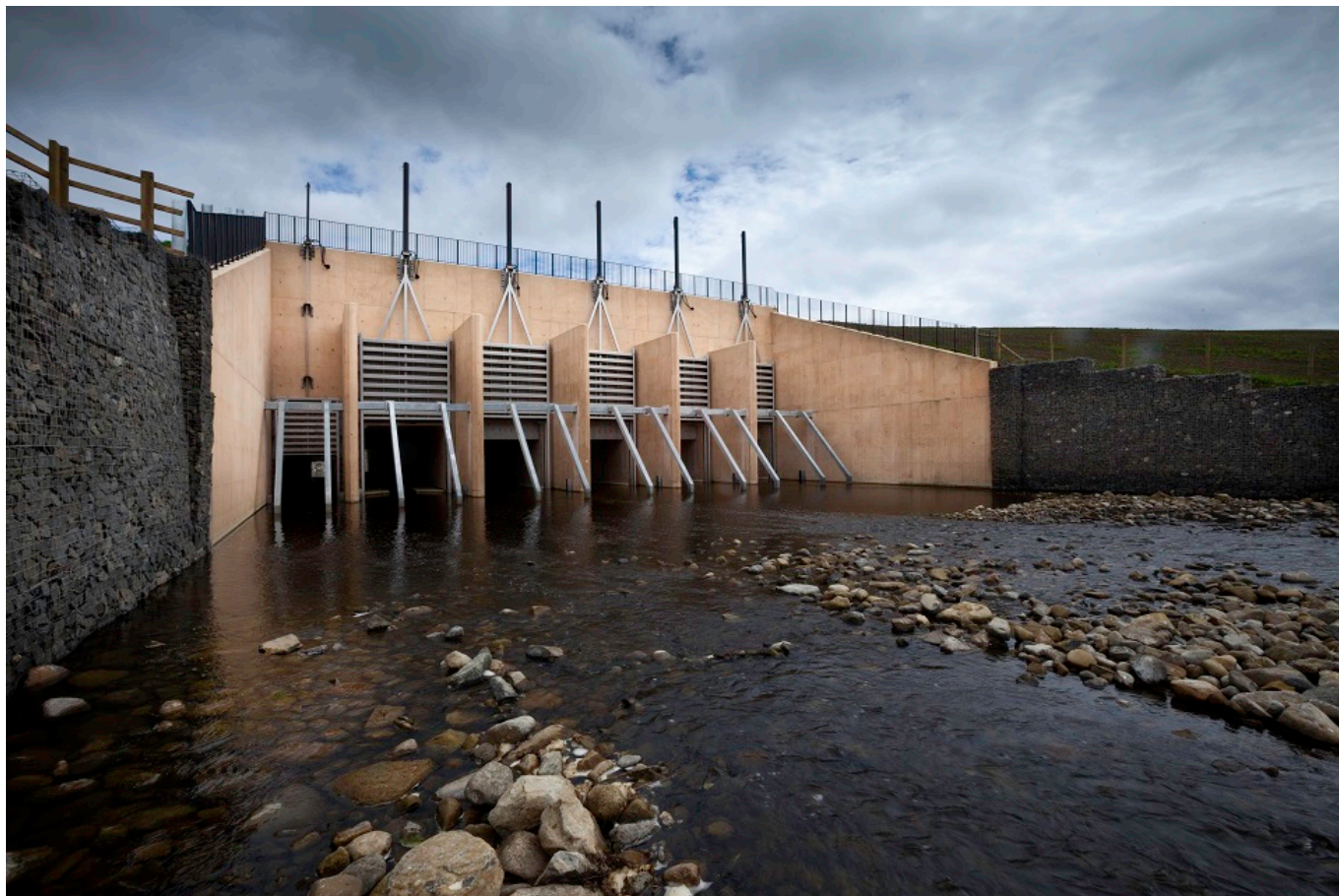
The large dam at Mitford