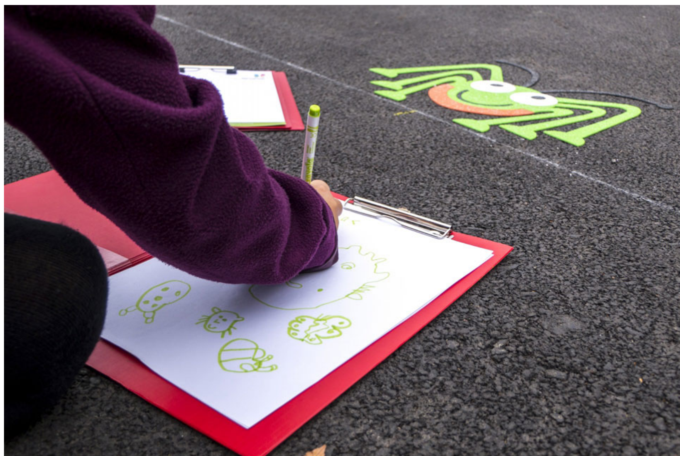
One of the children using the playground

On Friday 13 October 2017 new game markings were drawn onto the playground of Elmsleigh Infant and Nursery School in Swadlincote, Derbyshire.