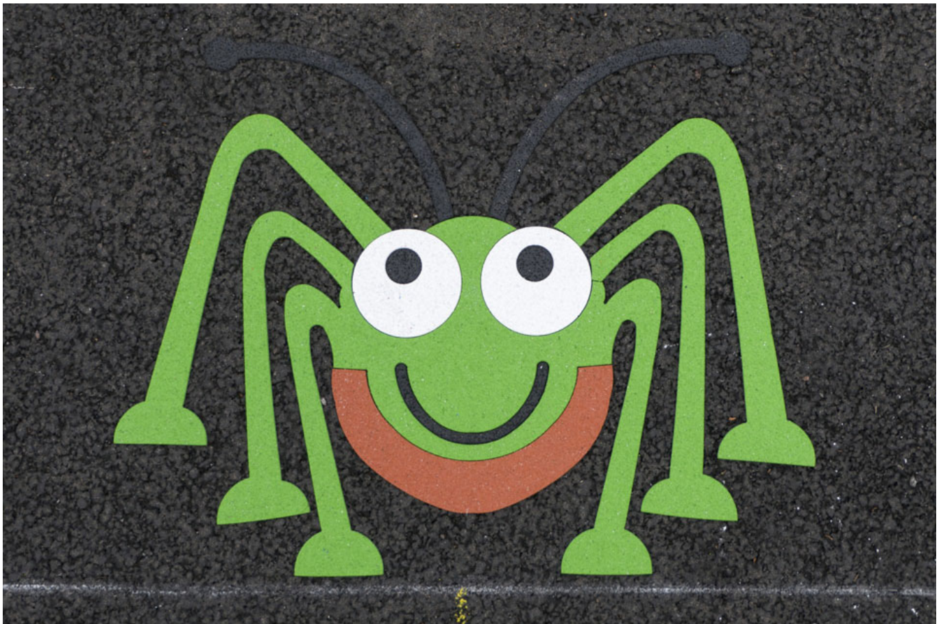
A playground decoration

Specialist contractors working on behalf of the Coal Authority reinstated the markings, including a rainbow and number squares that have been designed by the youngsters themselves.