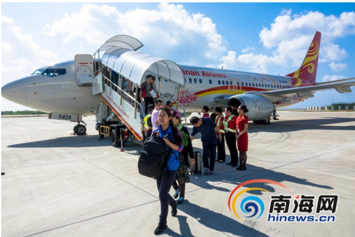
Passengers get off a charter flight at Yongxing Airport in Sansha city of south China's Hainan province on Thursday, January 26, 2017.