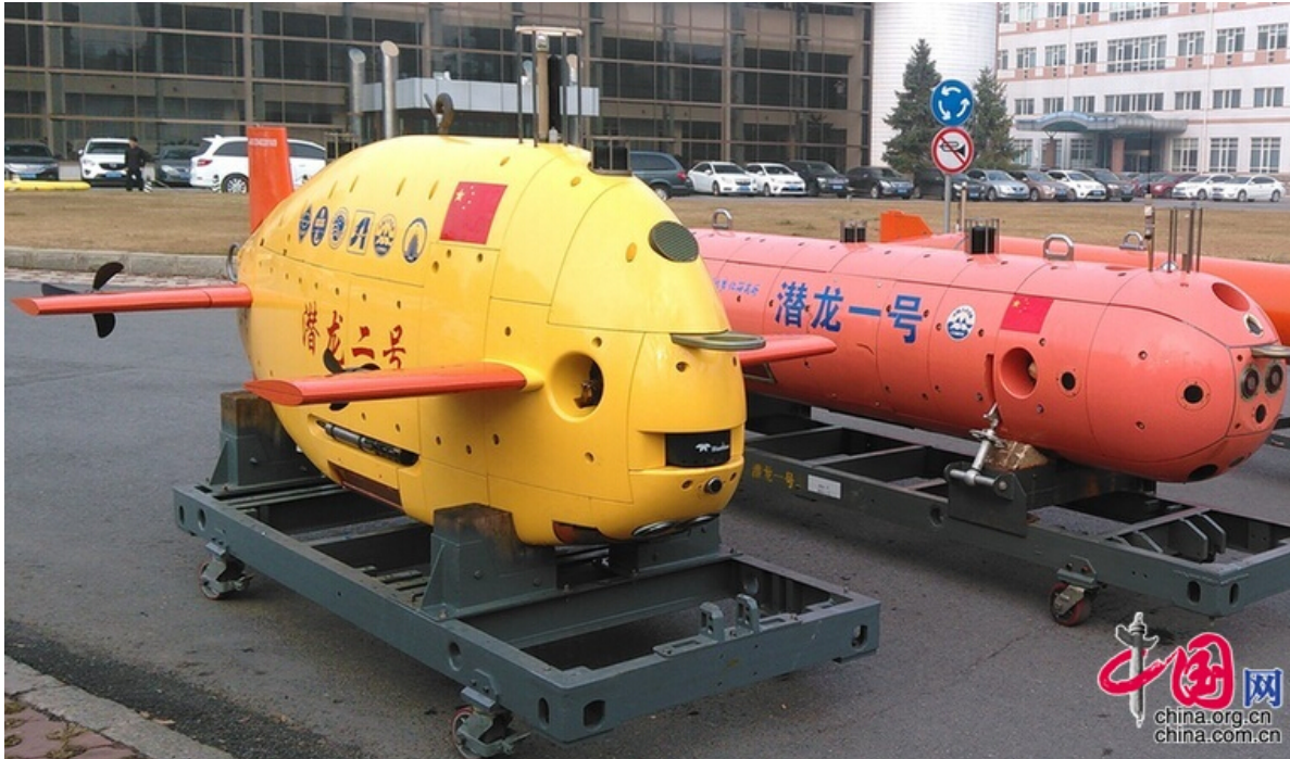
“Qianlong 1” (R) and “Qianlong 2” unmanned submersibles.

Chinese scientists started their 38th ocean scientific expedition on Monday, with the country’s first deep-sea manned submersible Jiaolong.