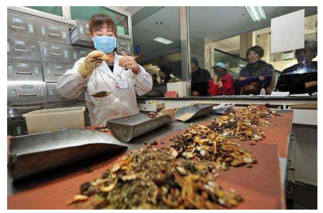
China is working on a law that will help pharmacists properly prepare and allocate medicine.

China is working on a law that will help pharmacists properly prepare and allocate medicine, according to the country's health authorities.