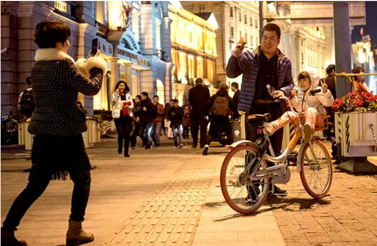
A girl poses for a photo while sitting in the basket of a bike owned by Mobike, a bike-sharing service provider, at the Bund in Shanghai on New Year's Eve.

The operators of three major bike-sharing apps have pledged to make their services less accessible to children in response to Shanghai traffic and education authorities' calls for improved safety.