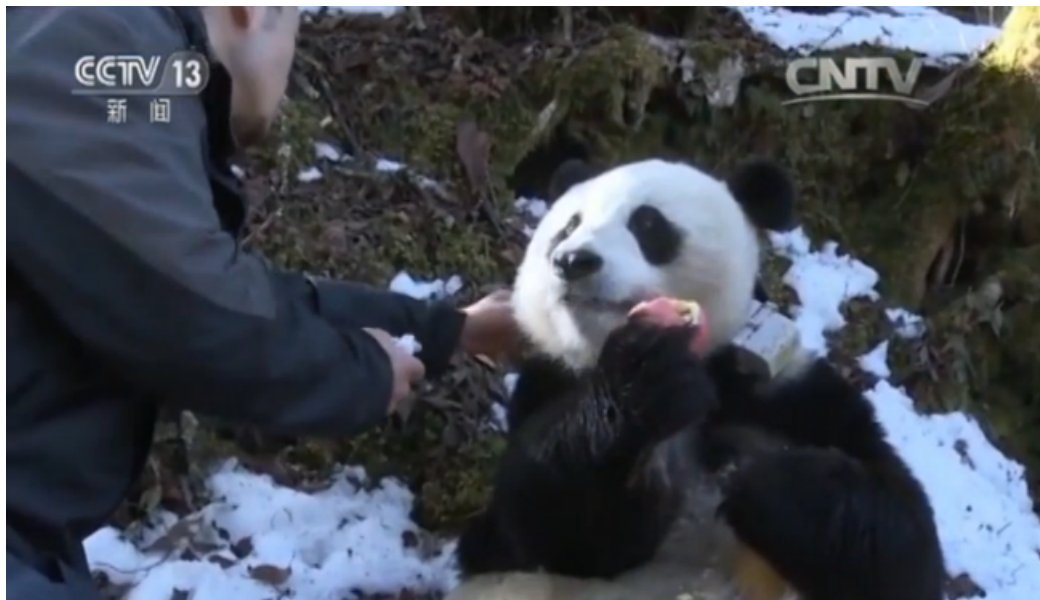
Giant panda Caocao.

Chinese researchers confirmed that Caocao, a female giant panda in captivity, has completed natural mating with a wild male companion on March 23, 2017, which marks the first such instance in the world and is regarded as a breakthrough in the country's panda breeding.