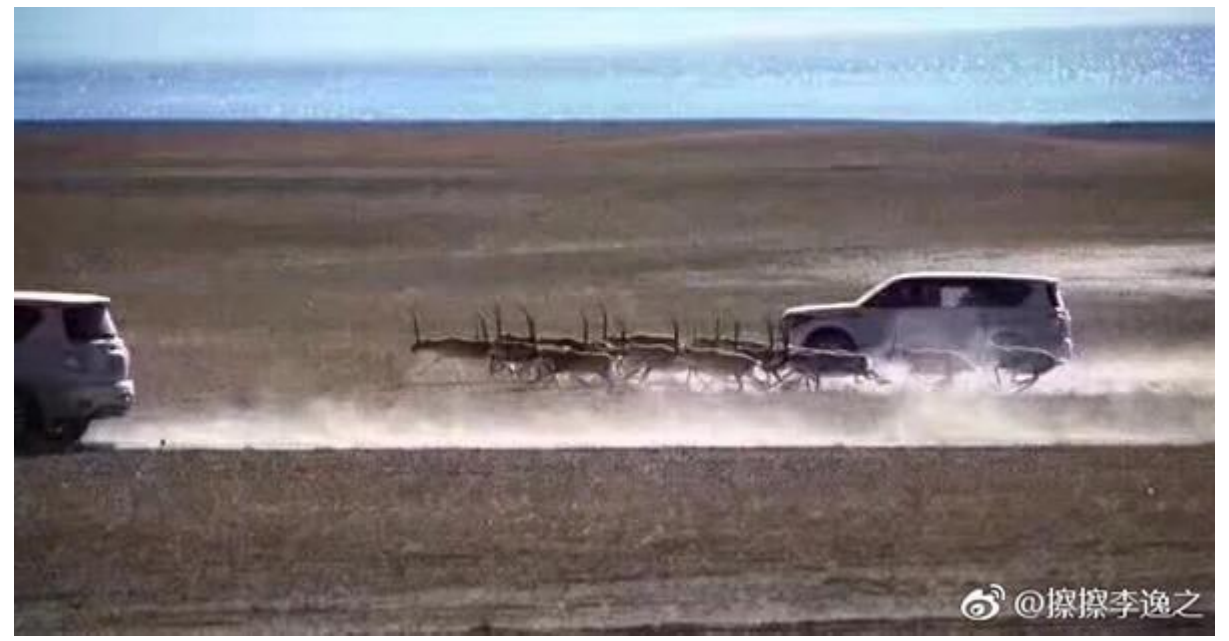
Photos of two white off-road vehicles chasing Tibetan antelopes on October 4, 2017 were posted online two days later.

An official investigation was immediately launched by local police.