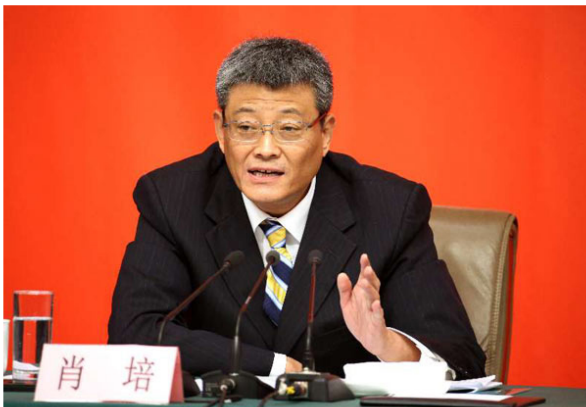
Xiao Pei, deputy secretary of the Central Commission for Discipline Inspection of the Communist Party of China, answers questions from journalists at the news conference, on Oct 26, 2017.

The establishment of supervisory commissions at various levels and their working together with the disciplinary authorities of the Communist Party of China are not to enlarge the power of discipline inspectors but to make anti-graft efforts more concentrated and standardized, a senior discipline official said on Thursday.