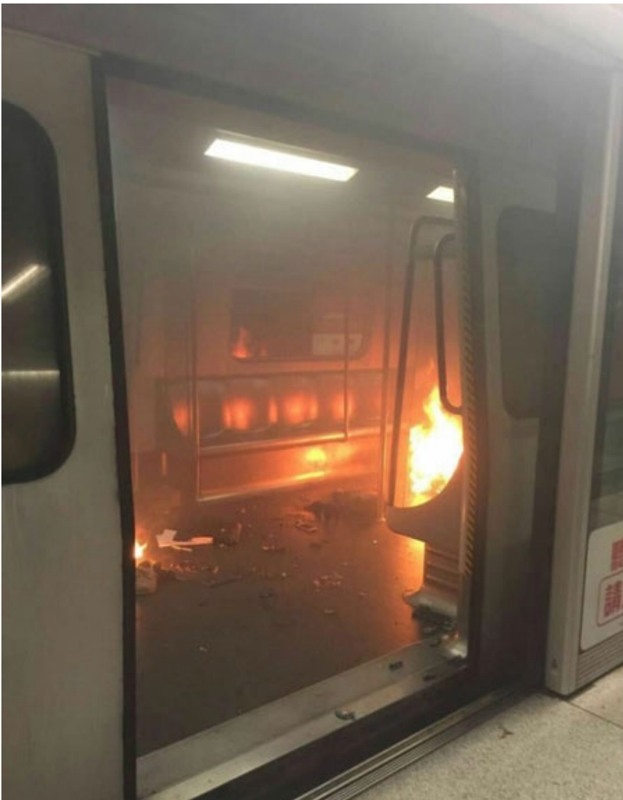
A fire is seen in an MTR train in Hong Kong on Feb 10, 2017.