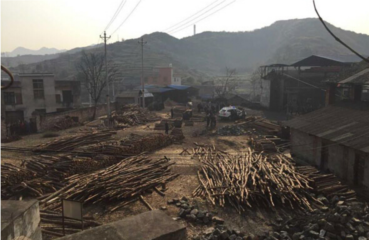
Photo taken on Feb. 14, 2017 shows the scene where a blast hit a coal mine in central China's Hunan province.

Eight people have been confirmed dead and three are missing after a blast hit a coal mine in central China's Hunan province on Tuesday.