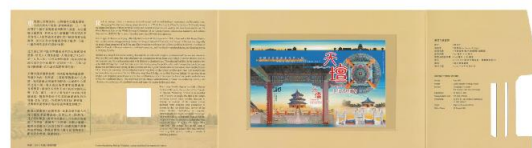
Presentation Pack (Inside).