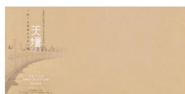
First Day Cover.