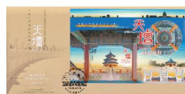
Serviced First Day Cover affixed with a Stamp Sheetlet.