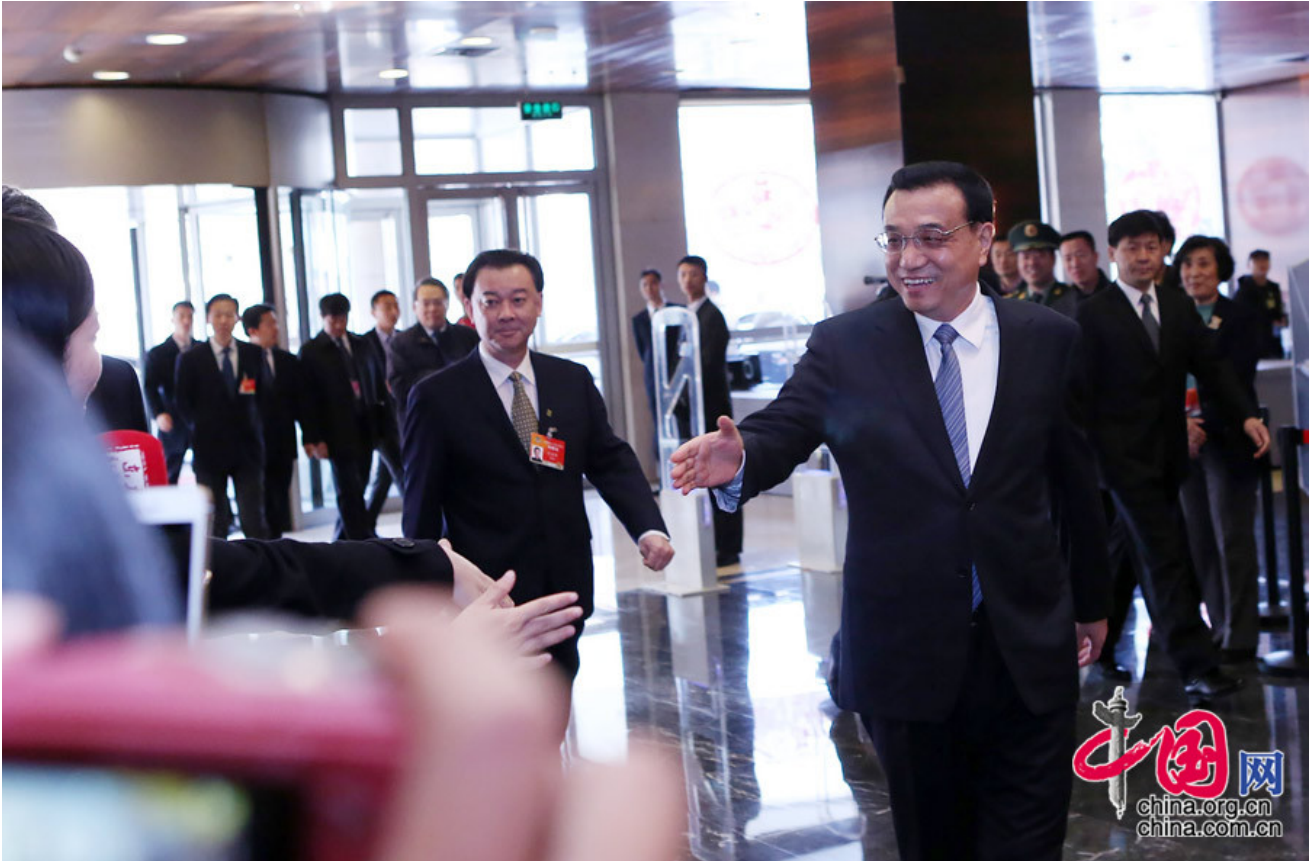
Chinese Premier Li Keqiang goes to join political advisors in their panel discussions on Saturday.

Meeting with advisors from economic and agricultural sectors during the the ongoing session of the 12th National Committee of the Chinese People's Political Consultative Conference (CPPCC), the premier highlighted the main theme of "seeking progress while maintaining stability" in economic work.