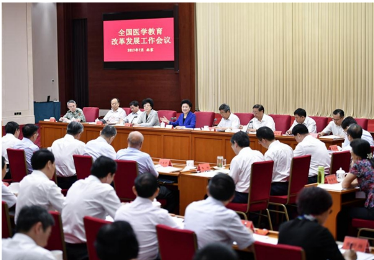
Chinese Vice Premier Liu Yandong (5th L rear) speaks at a national conference on medical education reform in Beijing, capital of China, July 10, 2017.

Chinese Premier Li Keqiang has instructed education and health authorities to push forward the country's medical education reform and improve professional training to build a "healthy China."