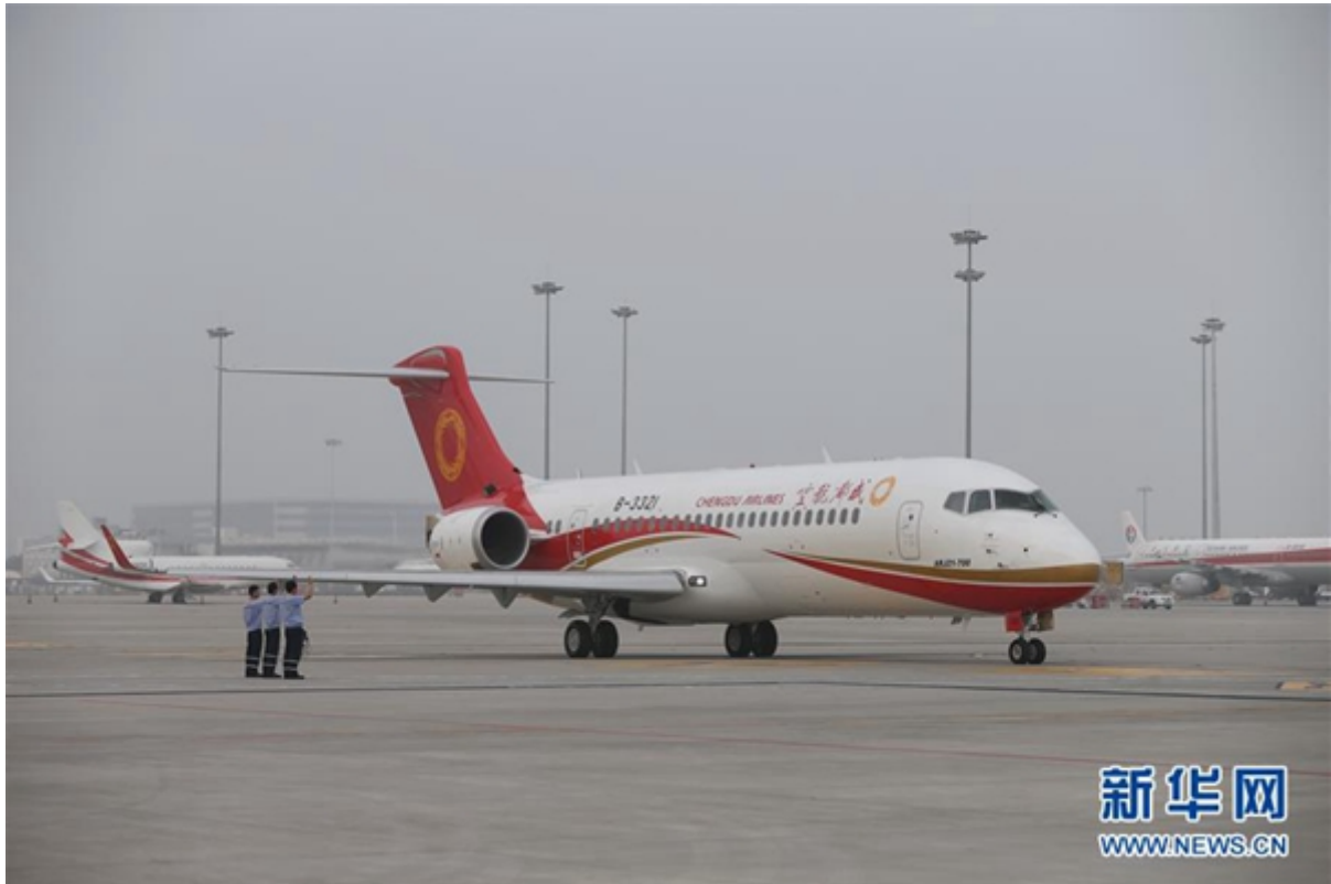
A regional jetliner ARJ21-700 is ready to take off.

A Chinese aircraft manufacturer has been certified to mass produce the country's home-grown regional jetliner ARJ21-700.