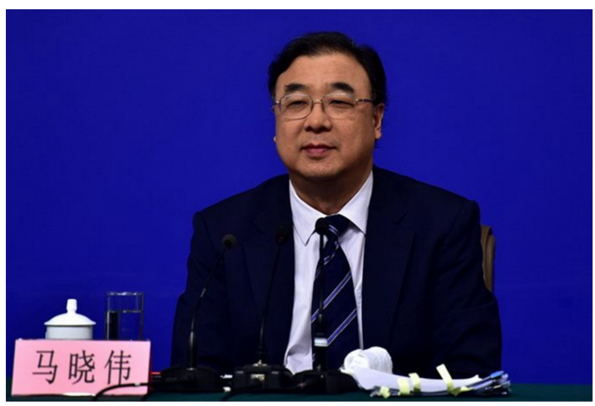
Ma Xiaowei, deputy head of the National Health and Family Planning Commission (NHFPC)

The state health authority Thursday urged the strengthening of maternal safety to reduce maternal and infant mortality.