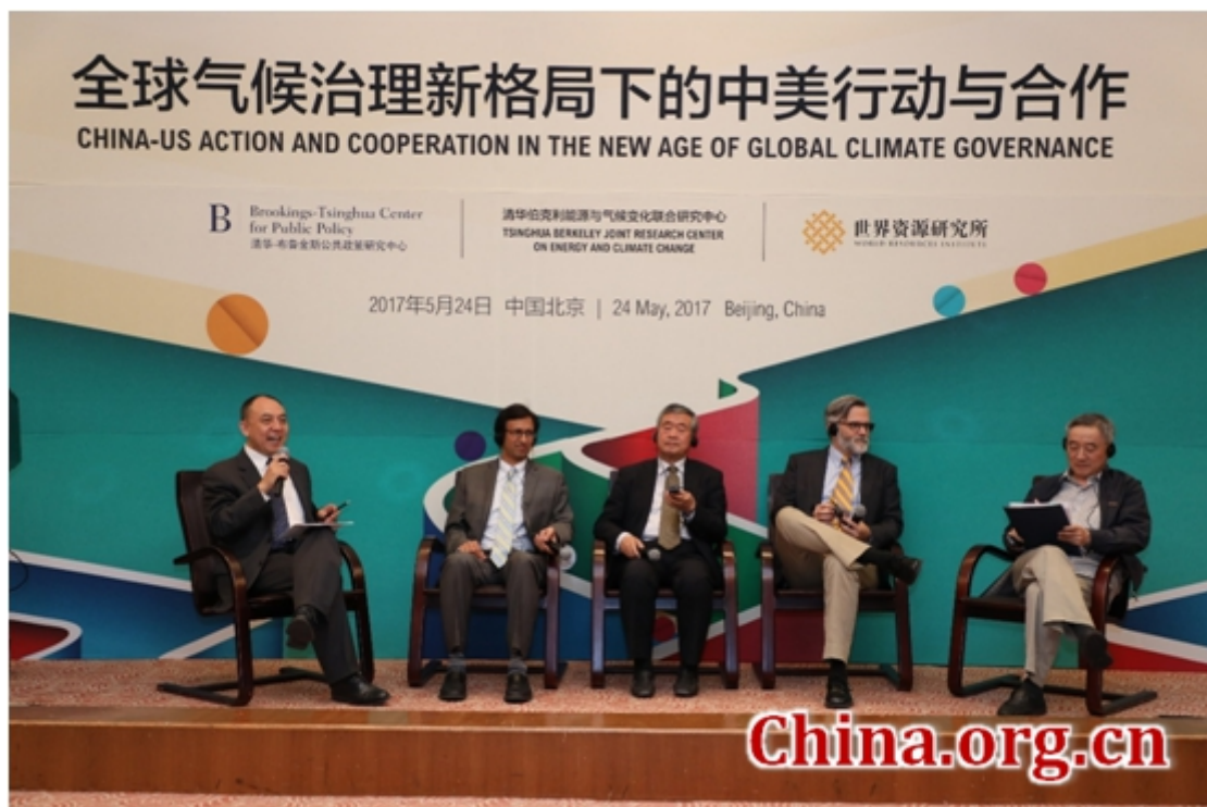
Experts from home and abroad take part in a round-table discussion on May 24.

China will continue to meet promises made at the Paris Climate Change Conference and take effective measures to tackle climate change, no matter what kind of choices the U.S. new administration makes on the issue, a top Chinese climatologist said.