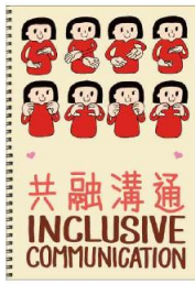
Presentation Pack (Cover).