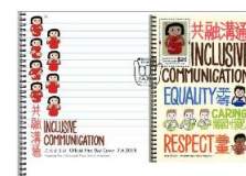
Serviced First Day Cover affixed with a stamp sheetlet.