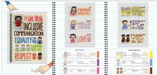
Presentation Pack (Inside).