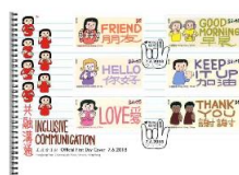
Serviced First Day Cover affixed with a set of 6 stamps.